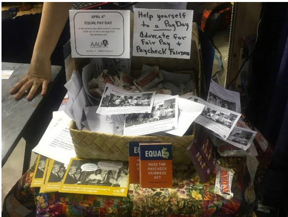
A Woman's Affair

Visit http://www.aauw.org/fairpay for things that you can do to advocate for Paycheck Fairness and Fair Pay/Equal Pay.