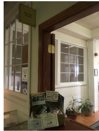
Fairbank's Mayor's Office