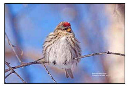
Red poll.